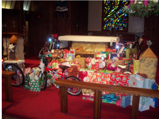
Gifts for the children of High Point