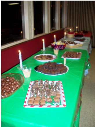
Death by Chocolate