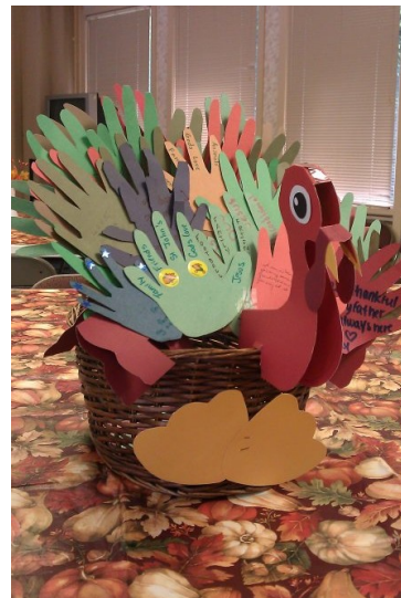
Middle Schoolers made a wonderful turkey for all to be able to give thanks. Parishioners took a "hand" and wrote on it what they were thankful for. Then they attached the hand to the turkey as its feathers.