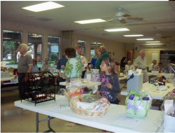
Checking out items for Silent Auction