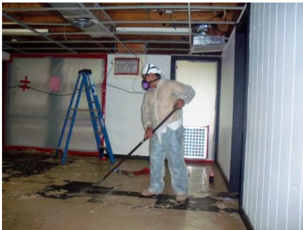
Removing flooring that contains asbestos required mask and protective clothing. The building was off limits until air quality tests showed that mold levels were below safety levels. See update on page XX